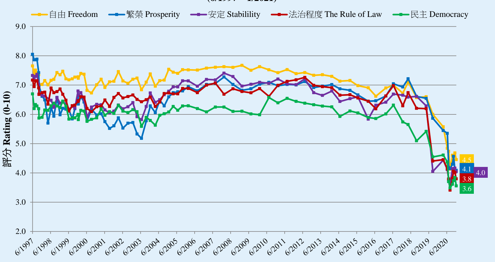
調查月份 Month of Survey